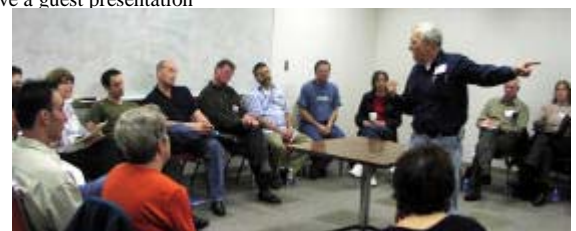
Convenors share experiences in workshops at 2004 Congress