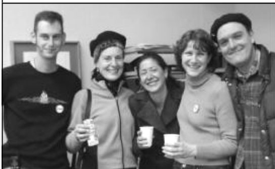
After the 2002 Congress (Bill Carpenter photos)

with procedural rules the Congress may adopt." §5.10. In practice, past Congresses have run on a consensus-building model, and parliamentary maneuvering (point of order, point of personal privilege, etc.) has been absent.