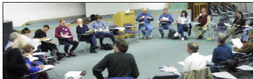
Delegates' Assembly at the 2002 Congress