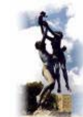
Family Fountain in downtown Guelph

All presentations on Saturday are open to the public.